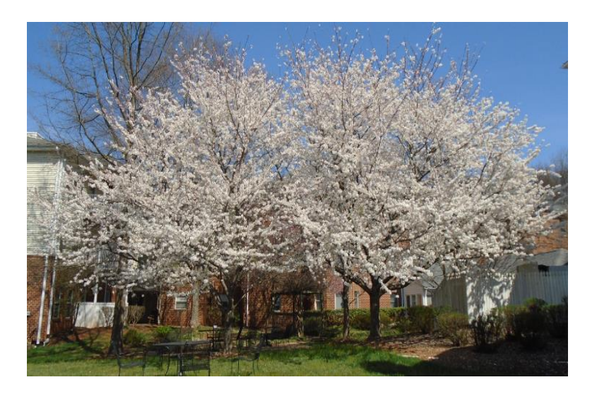
Spring is in the air as evident by the beautiful trees in the courtyard.