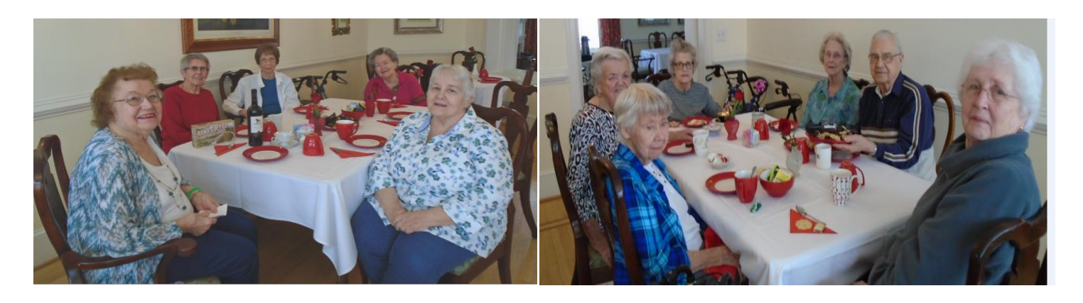
\mathcal{L}\mathit{unch} \ \mathcal{A}\mathit{Learn} - Mar 23<sup>rd</sup>, discussing Simple Exercises you can do anywhere and pretty much anytime.