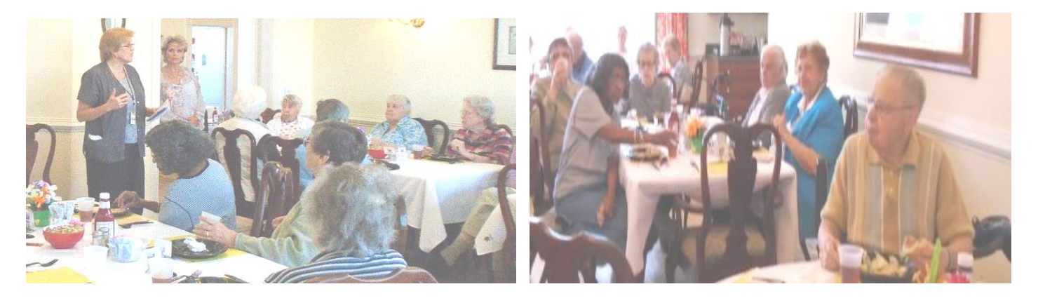
More pictures for both events can be seen on the Bulletin Board in the Sargent Connector.