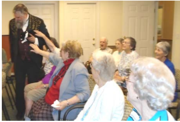
Pulling the bunny out of the hat and giving everyone an up close look and pat.